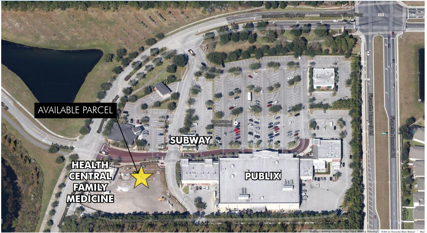
SHOPPING CENTER MAP