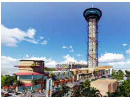
The Skyscraper at Skyplex is a $200 million retail and entertainment destination slated for International Drive. (Wallack Holdings LLC)

The new $200 million, 495,000-square-foot Skyplex will be quite the destination for Orlando's 59 million annual visitors, but it will also be a huge job creator.