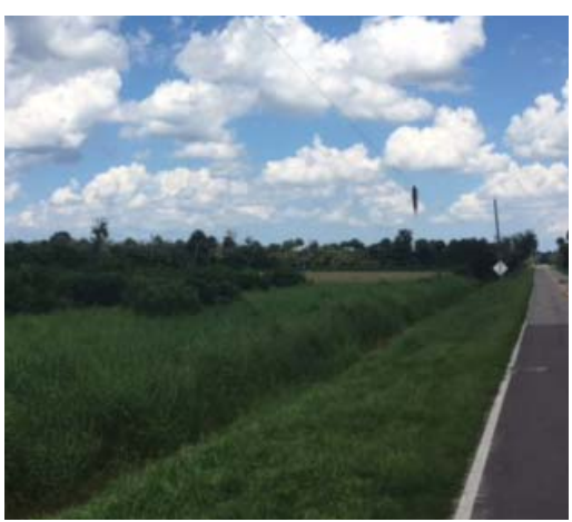
Offering subject to errors, omission, prior sale or withdrawal without notice.