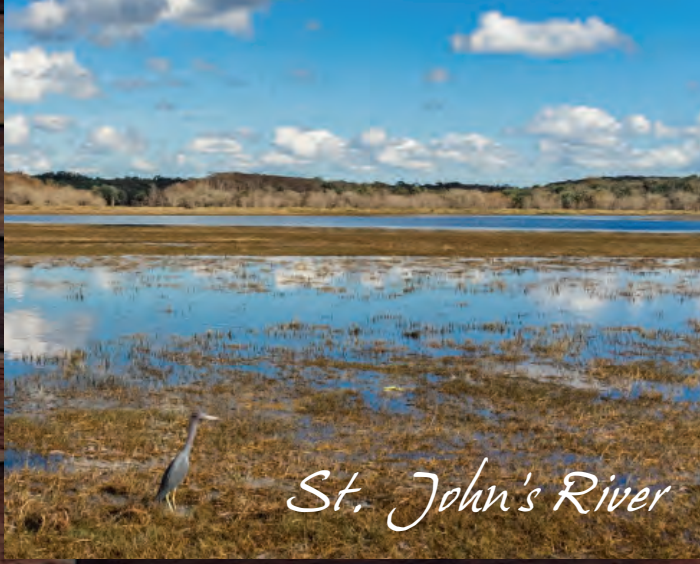
St. John's River