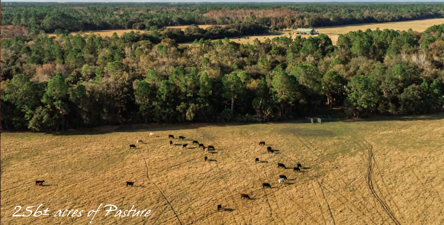
256± acres of Pasture