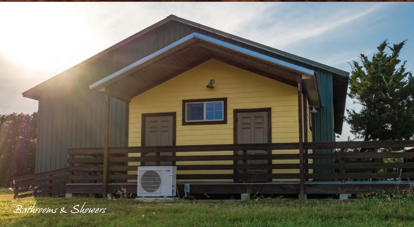
Bathrooms & Showers